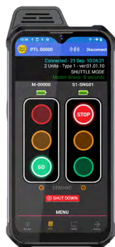
Smart Terminal Remote Control

Designed for easy fold away and storage function