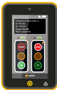
RF Remote Control